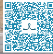
RIO BRANCO ALIMENTOS (PIF PAF) - Poultry slaughterhouse