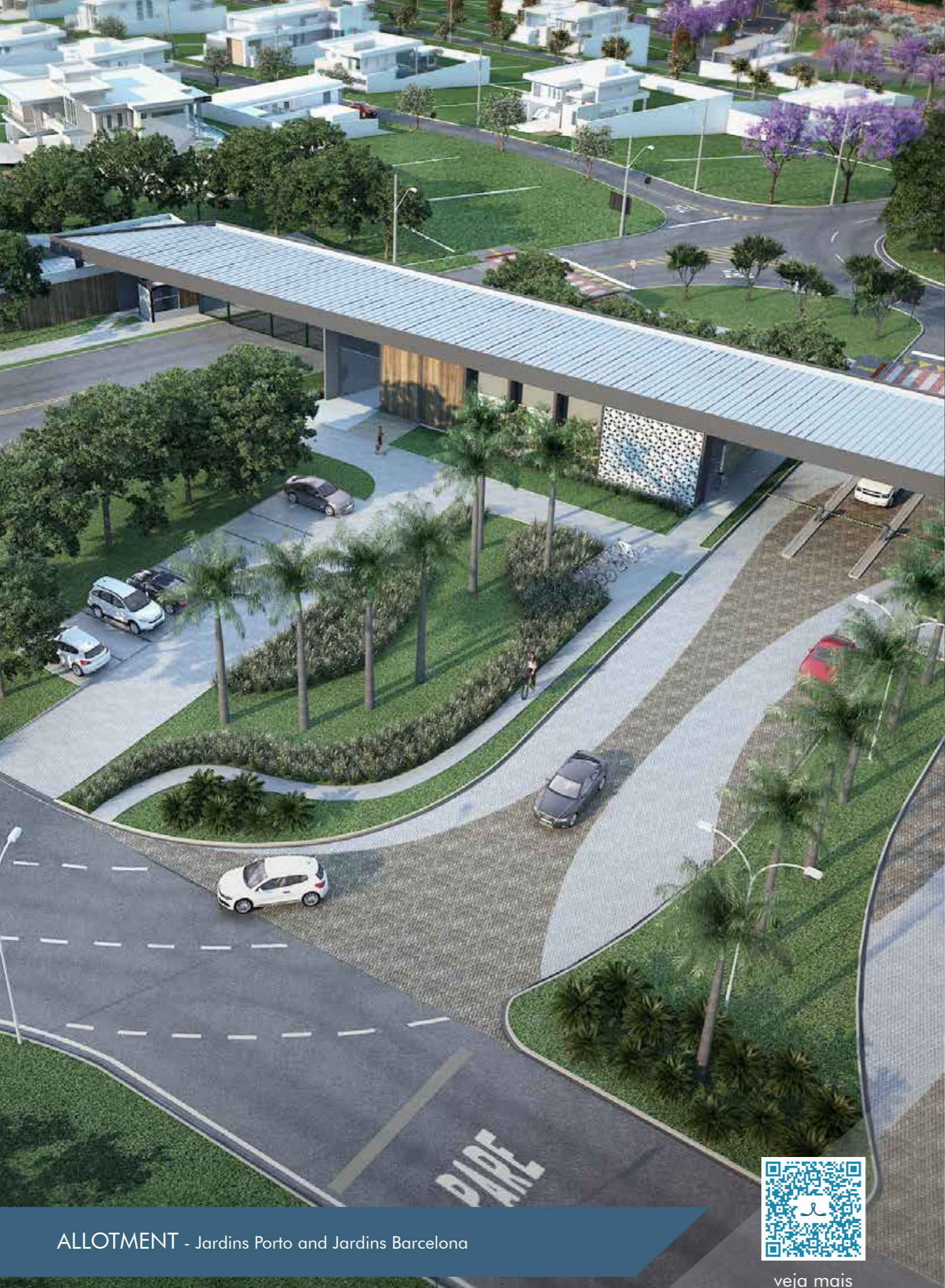
ALLOTMENT - Jardins Porto and Jardins Barcelona