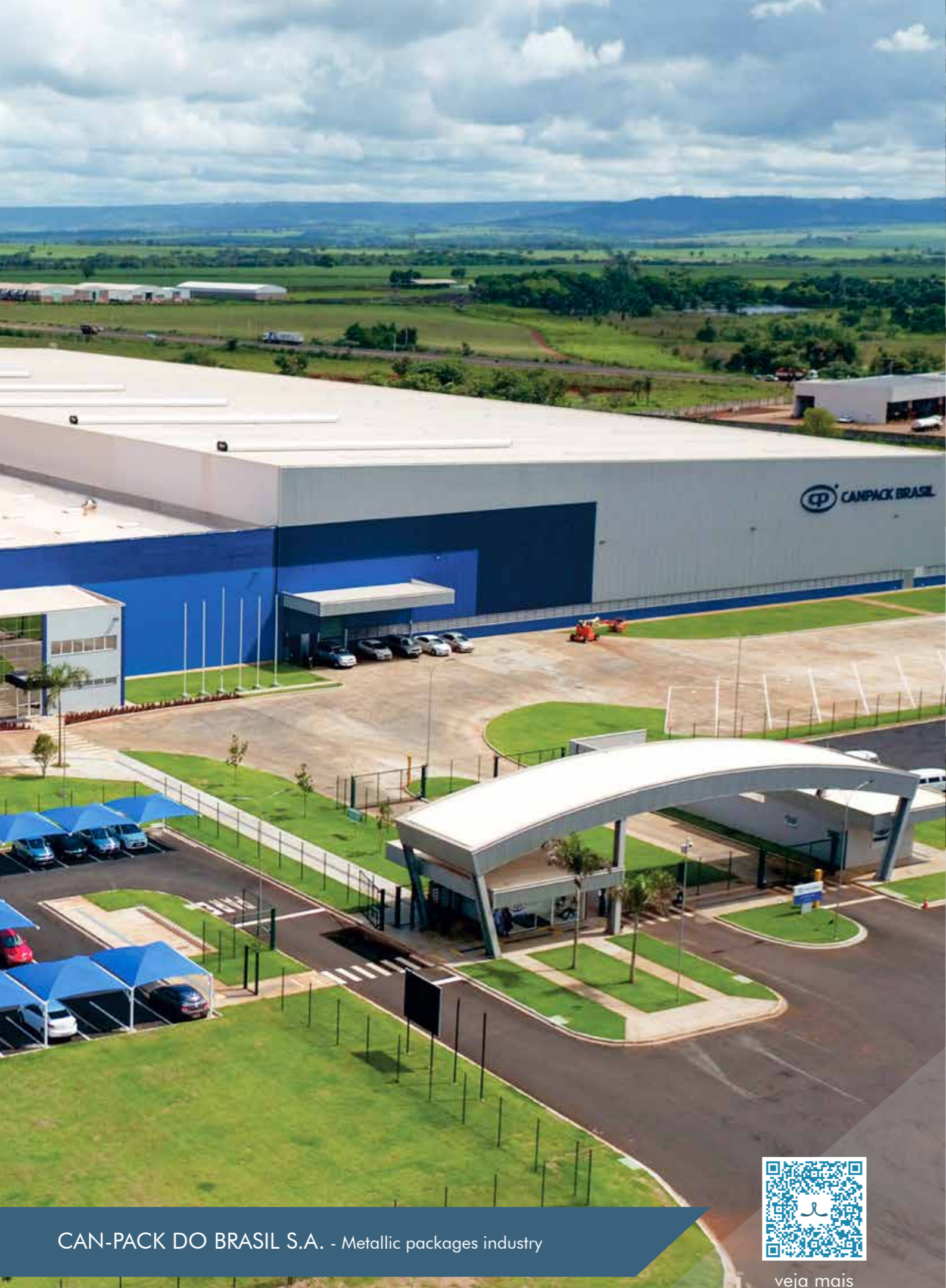
CAN-PACK DO BRASIL S.A. - Metallic packages industry