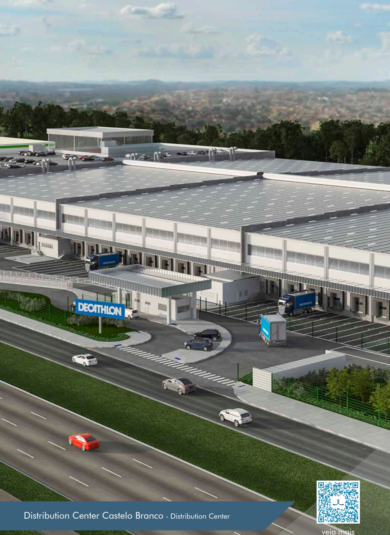
Distribution Center Castelo Branco - Distribution Center