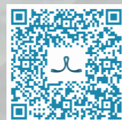
BIMBO DO BRASIL - Bakery factory