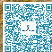
HOUSING ALPHAVILLE - Gated Community