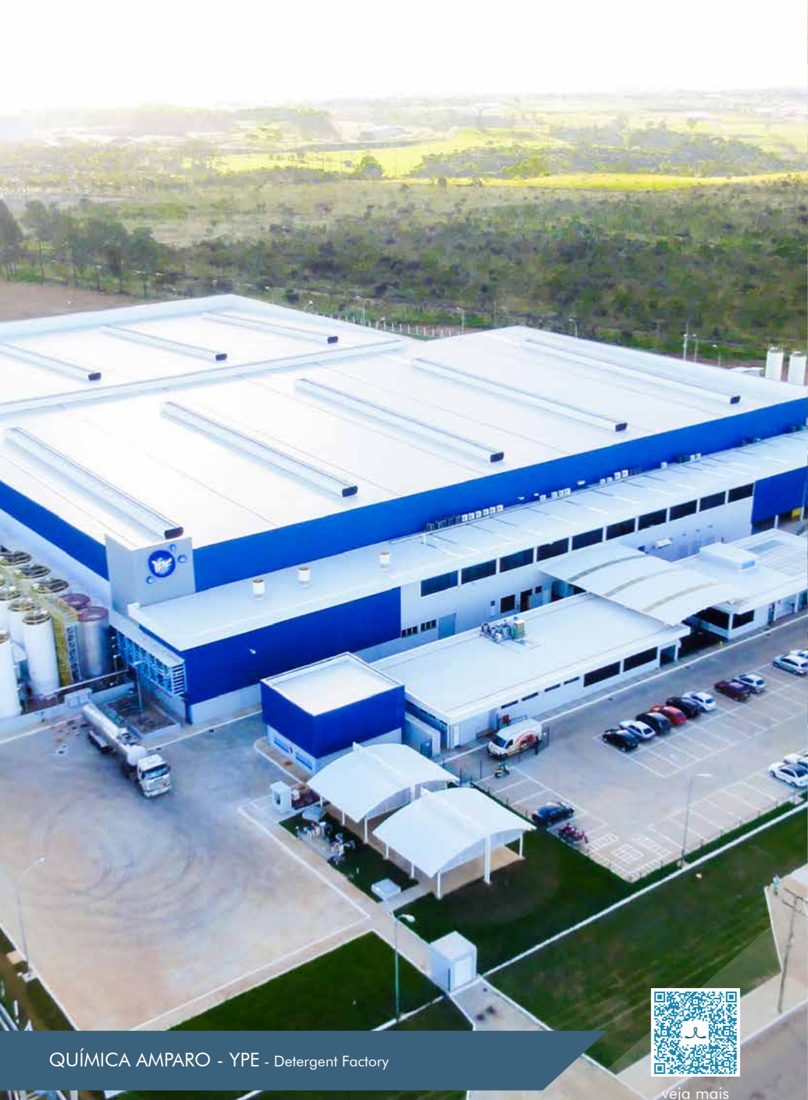
QUÍMICA AMPARO - YPE - Detergent Factory