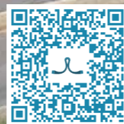
FLEX CENTRO EMPRESARIAL - Logistic and business complex