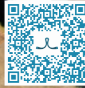
UTE GOIÂNIA II - Thermoelectric Power Plant